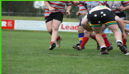
(Hit hard and tackle low)

We talk with our Hands We play rugby with our Hearts We unite under the Southern Cross